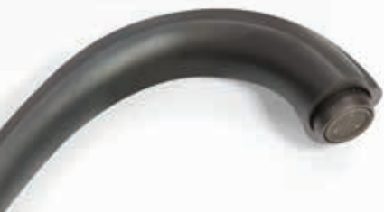
Room Temperature Blackeners for Iron & Steel

- Used to neutralize spent Tru Temp solution