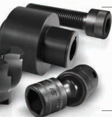
Mid Temperature Black Oxide