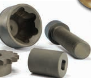
Anti-Galling for Iron/Steel