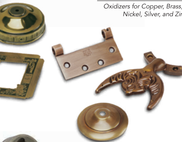
Oxidizers for Copper, Brass, Bronze, Nickel, Silver, and Zinc

- Brush-on or immersion blackener for stainless steel